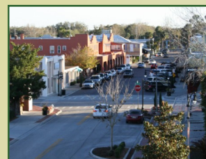
Downtown St. Cloud