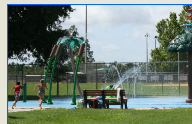
Chris Lyle Aquatic Center Splash Pad