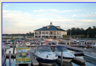
St. Cloud Marina