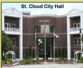
St. Cloud City Hall

The city's slogan is "Celebrating Small-Town Life"