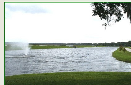
St. Cloud Lakefront